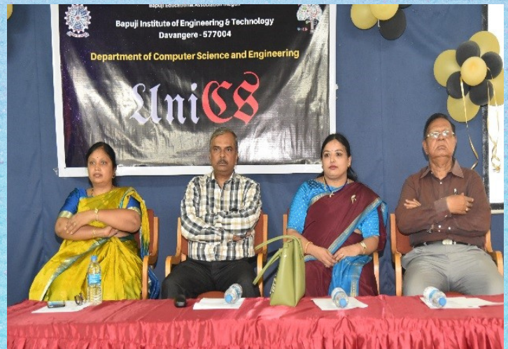
Forum Validictory and Farewell Function