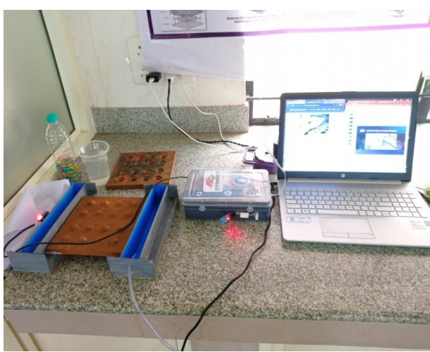
A Innovative Project: Hydroceramic Tile - A Passive Cooling System for Buildings