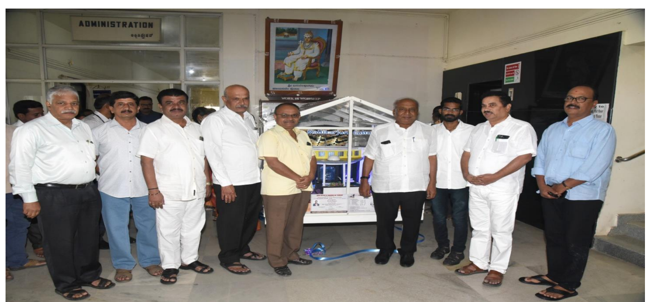
Model of S S Mallikarjun Cultural Center (Auditorium) at BIET Campus inaugurated on 26th January 2021