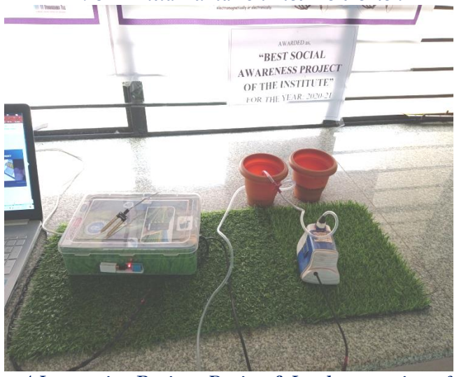
A Innovative Project: Design & Implementation of Automated Irrigation System