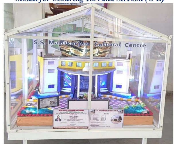
Model of S S Mallikarjun Cultural Center (Auditorium) at BIET Campus