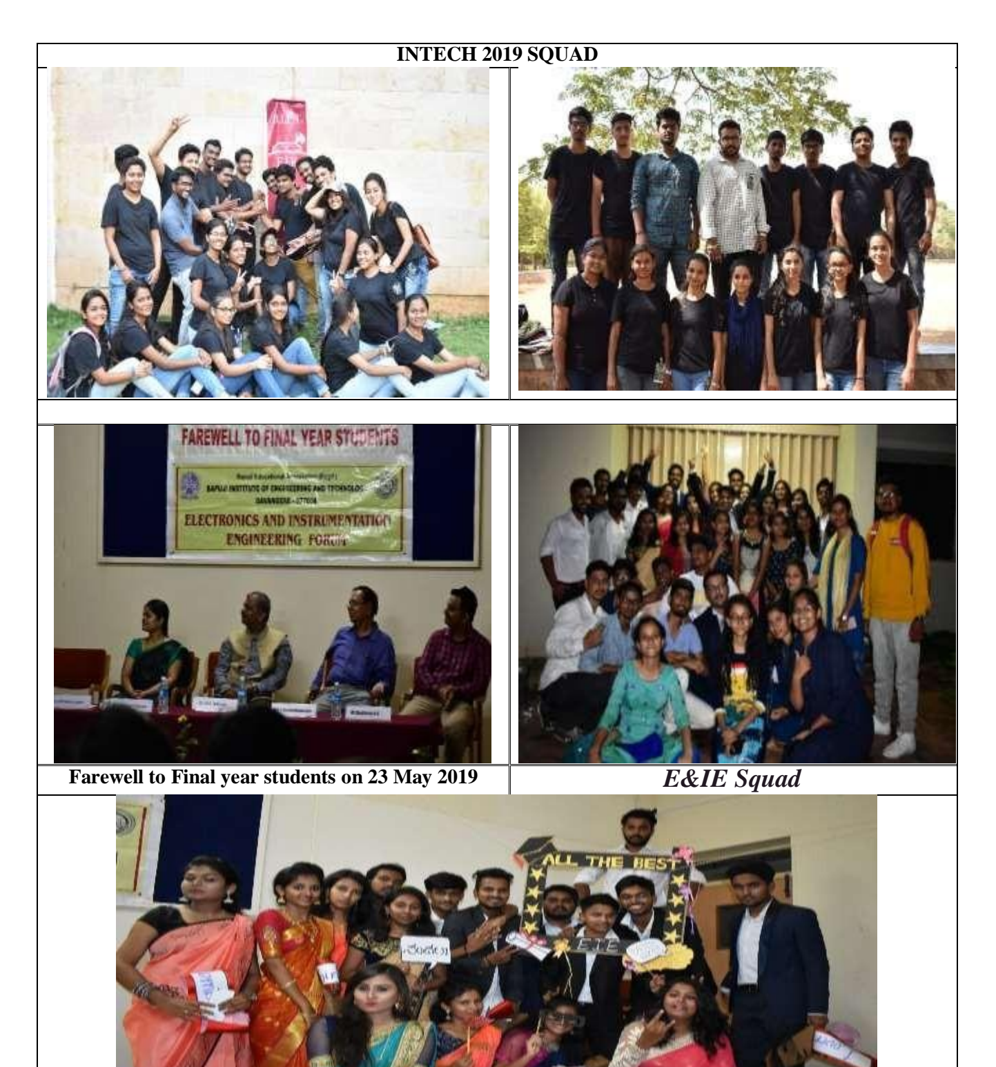
Unforgettable memories behind goodbyes.