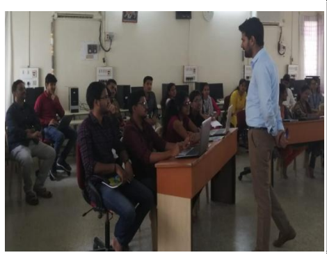
Interaction with resource person during Three days hands on workshop on "Embedded IoT & its Applications"