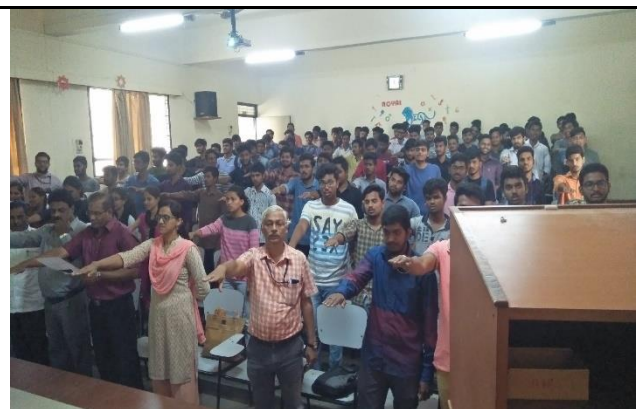
"70th year of Indian Constitution Day" on 26–11-2019