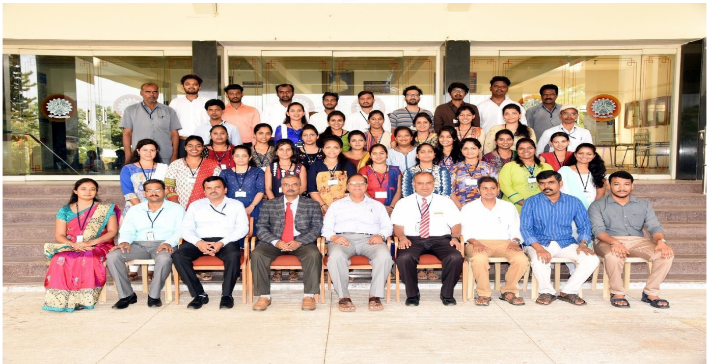
GROUP PHOTO OF BATCH 2018 - 2019