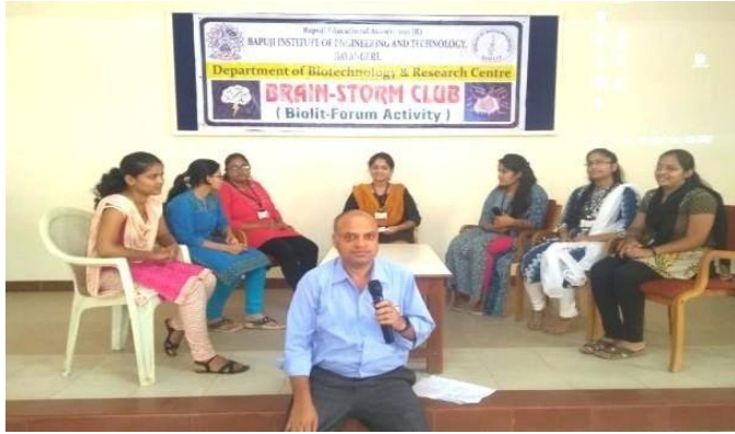
Brainstorm- Debate event