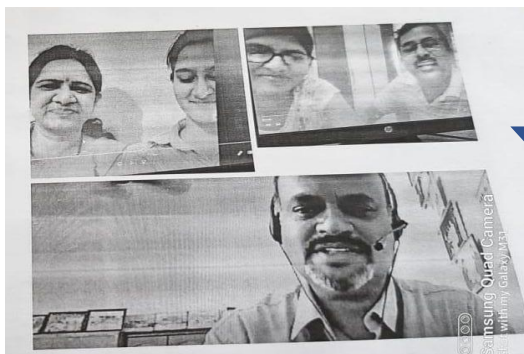
Online Parent- Teacher Meeting