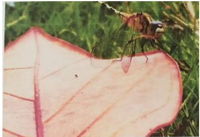
Photograph by Deepak G- 8 th sem