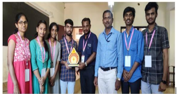
Participants in Science Mela at Moodbidri from 21st to 27th December 2022