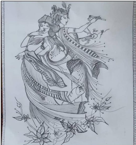
Ruchita P (4BD19EC093)