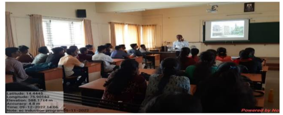
I Semester students Induction Program on 9 th December 2022