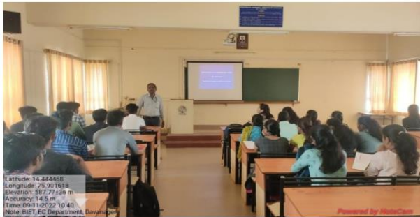
NBA Awareness Program for students on 9th November 2022