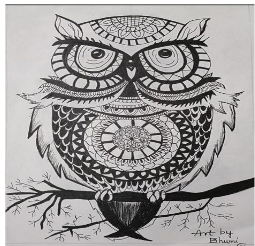
Bhumika N (4BD20EC402)