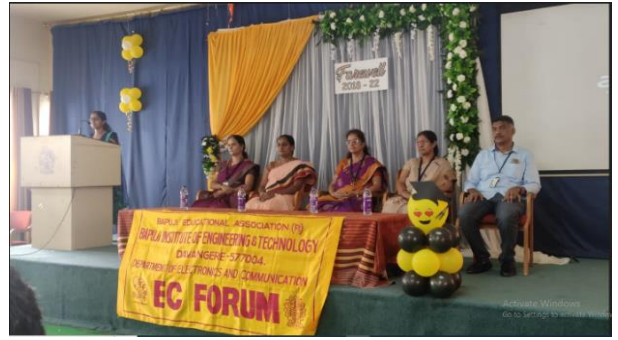
Farewell and Valedictory function on 9th July 2022