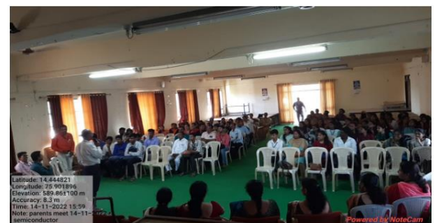
Orientation Programme and Parents Meet on 14th November 2022