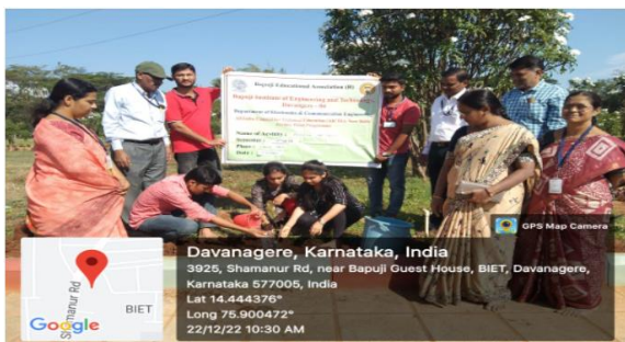
Plantation activity by students on 22nd December 2022