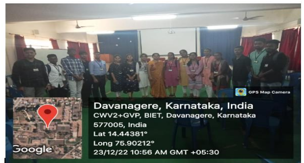
Training on Cyber Security on 23rd December 2022