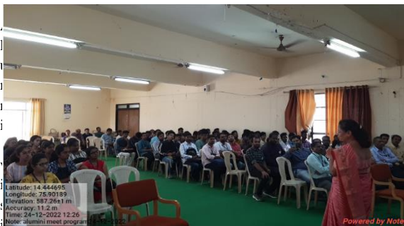
t to the Department on 24th December 2022.