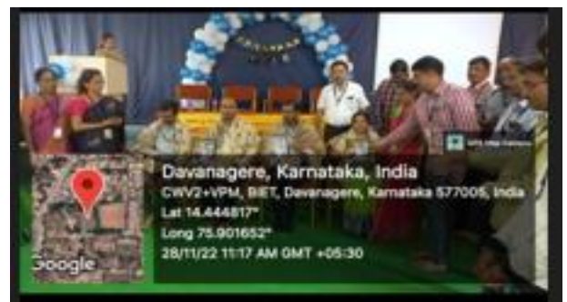
Felicitation to Ph. D. holders on 28th November 2022