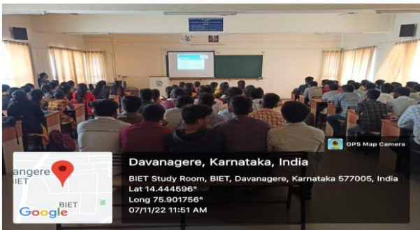
Online webinar on Global Education –GRE Session on 7th November 2022