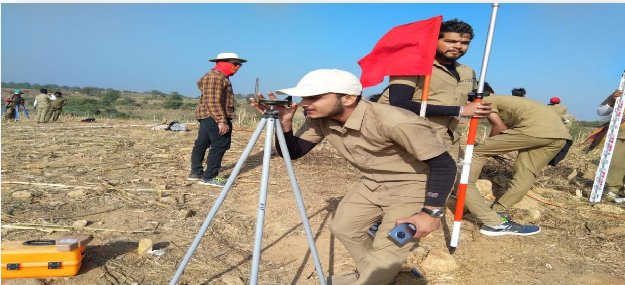
Survey Camp - 2020