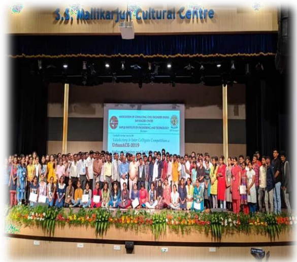
Construction and Demolition Waste Management (Eco-Construction) and Exhibition: URBANACE-2019 on 8 th to 10 th of August 2019