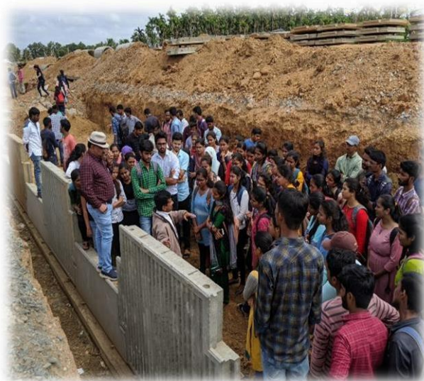
Site Visit to see Reinforced Earthen Wall for Embankment at NH-4, Harihara Date: 18 th July 2019