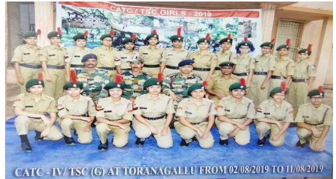
Students Participated in NCC CAMP Held at Toranagallu.