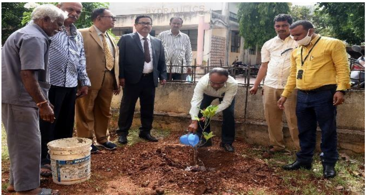
World Environment Day Celebration on 22 nd June 2020