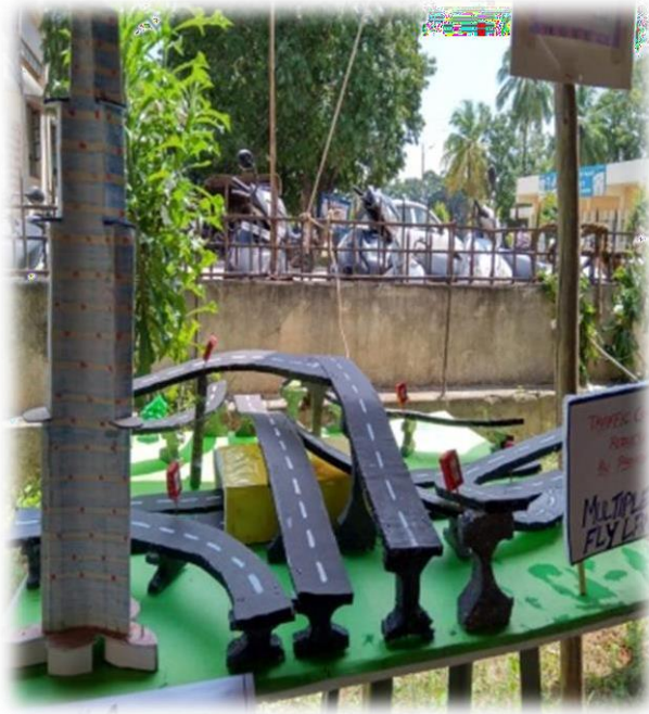
Model making competition held on 17 th September 2019