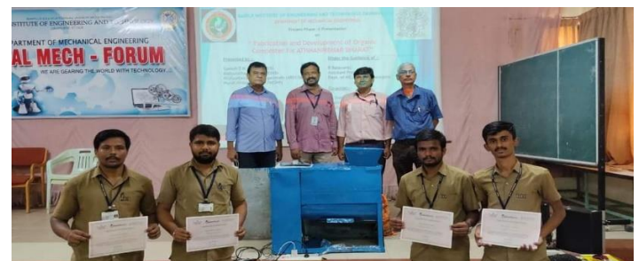
Project got Selected for Top 10 Indian Innovation Express