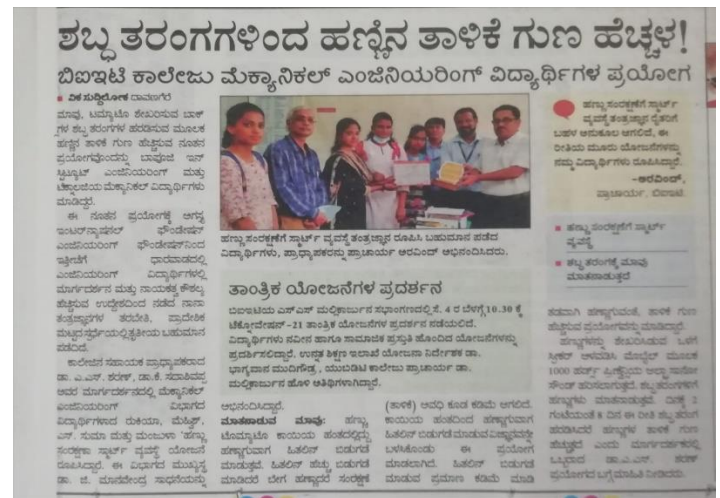
AnveshanA Regional award 20-21