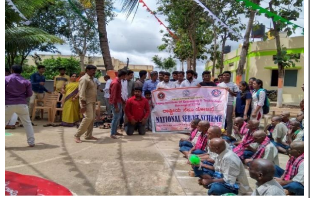
NSS Day at Rehabilitation centre, Thurchaghatta on 24-09-2019