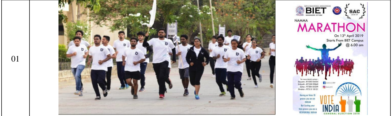
“Marathon on Voting Awareness” on 13-04-2019, in association with Student Academic Council, BIET