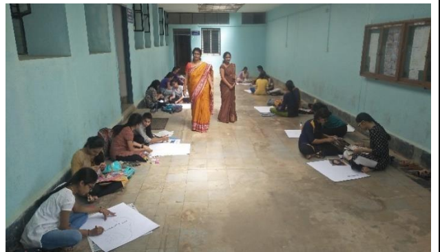
National Voter's Day on 21-01-2020.