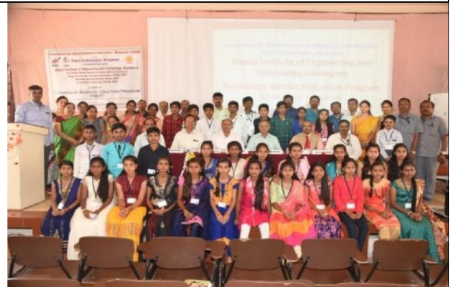
Technology Barrier Reduction Program-2019, unique program for high school children organized by Foundation for Advancement for education and Research (FAER) and Zebra Technologies, Bengaluru from 22-04-2019 to 10-05-2019 at BIET, Inauguration and Activities and Valedictory conducted during the programme