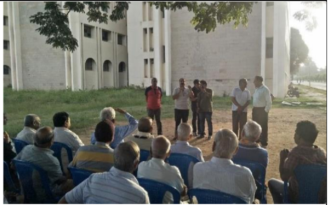
“Electrol Verification Programme” for Faculty members and Students from 08-10-2019 to 15-10-2019