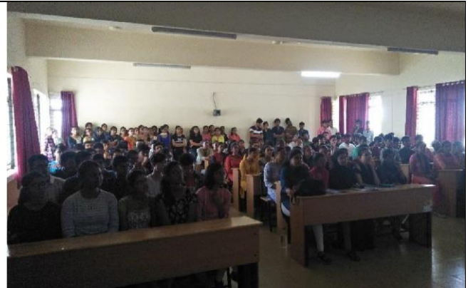
A "Plastic Awareness Programme" was organized by NSS volunteers by "Power Point Presentation – on the theme "Plastic Free India", creating awareness among students.