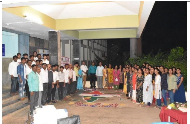
“Deepotsava” on the eve of “64 th Kannada Rajyotsava” by drawing the India Map, Karnataka Map and symbol NSS with colors and lighting the candles in the evening, inaugurated by the Principal and Director of the college on 03-12-2019,