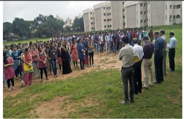
Oath taking programme on the eve of “Rashtriy | Sadbhavana Diwas, on 20-08-2019