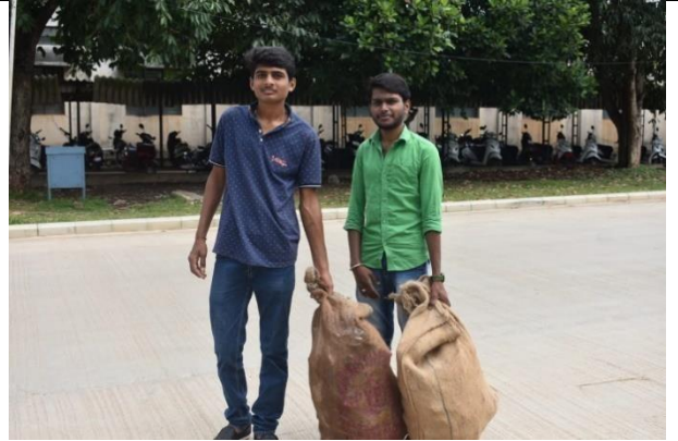
“Cleaning of the Campus” on 02- 10 – 2019, on the eve of Gandhi Jayanhti and Lal Bahddur Shastri Jayanhti and Swchatta Andolan, a programme