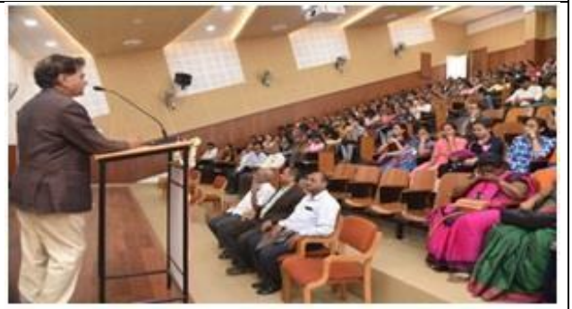
National Science Day on 28-02-2020.