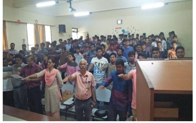
“70 th year of Indian Constitution Day” on 26–11-2019