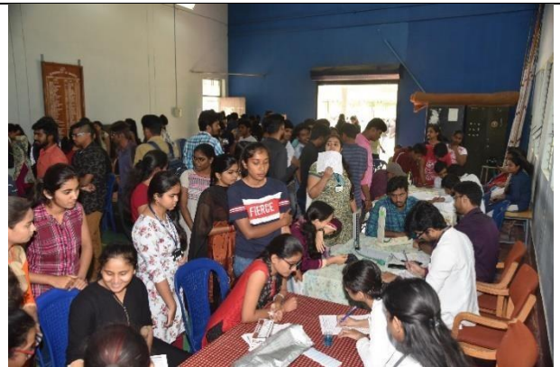
Blood Donation Camp on 27-08-2019, in association with S. S. Institute of Medical Sciences and Research Centre, Davangere.