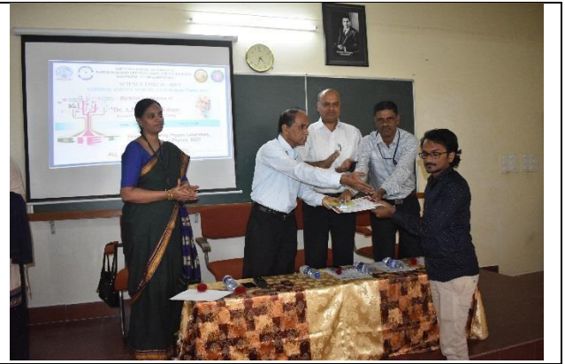
“Project Exhibition Programme - Science Expo 2K19”, “World Students’ Day, on 14-11-2019, in commemoration with Birth day celebrations of Dr. A.P.J. Abdul Kalam, Ex. President of India. Cash prizes and Certificates were distributed to the students.