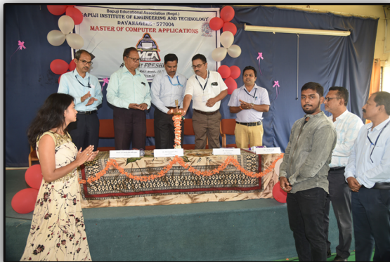
Inauguration of Welcome Ceremony to first year MCA