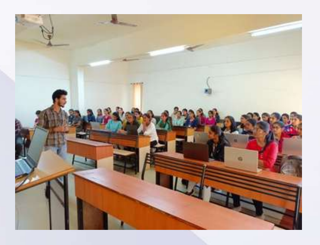
Glimpses of Workshop