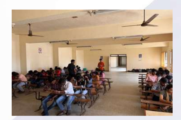
Glimpses of Competition

• Department of CS&E conducted 2 days' workshop on "Cyber security & Ethical Hacking" under UniCS in association with Cybersapiens for 45 5th semester girls students on 16th & 17th December, 2022.