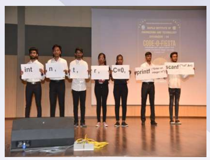
Inauguration of CODE-O-FIESTA

• In connection with International Women's Day 2022, Department of CS&E conducted "Ikebana: Flower arrangement Competition" for girls and lady faculty members on 14/03/2022.