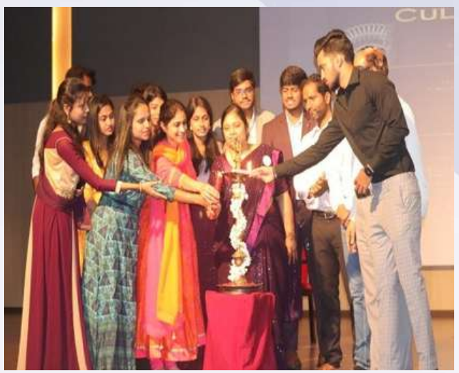
Inauguration of FRISSION-2022