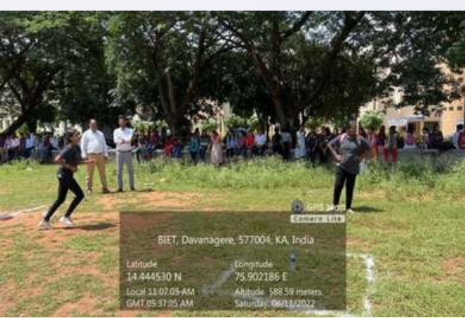
Glimpses of Tug of war, Dog and the Bone on 11th June 2022