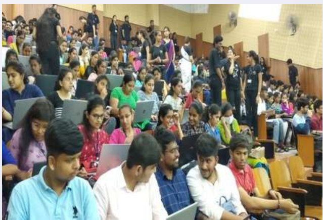
Students participation in the Workshop