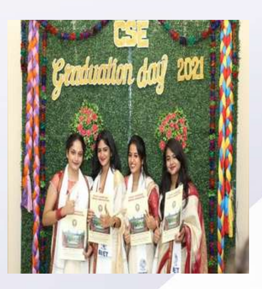
Glimpses of Graduation Day-2021