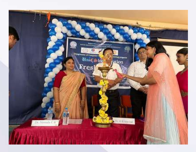
Glimpses of Forum Inauguration