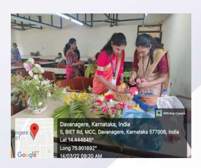
Faculties participating during the Competition