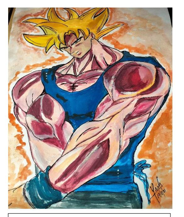
Art By, Yashaswini