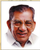
Dr. Shamanur Shivashankarappa