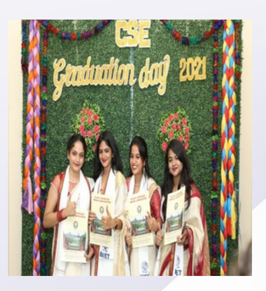
Glimpses of Graduation Day-2021