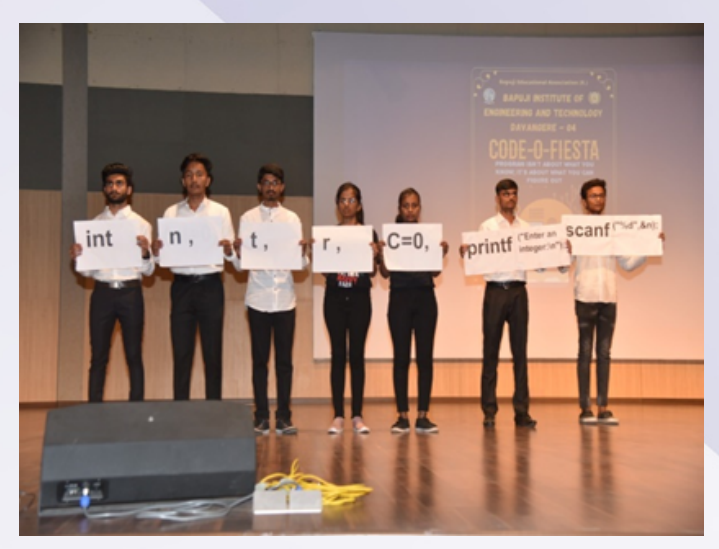
Inauguration of CODE-O-FIESTA

• In connection with International Women's Day 2022, Department of CS&E conducted "Ikebana: Flower arrangement Competition" for girls and lady faculty members on 14/03/2022.