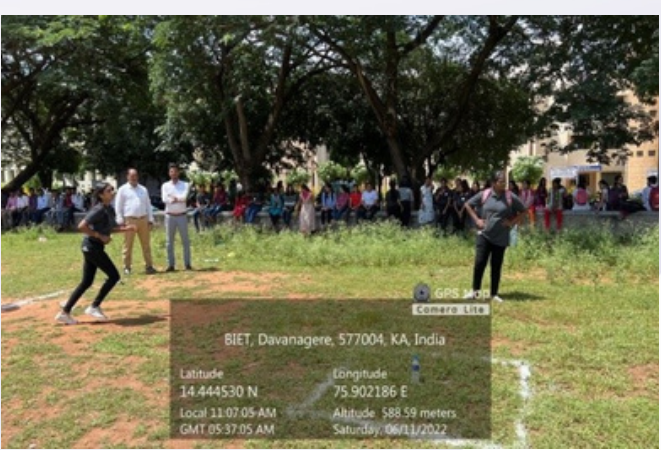
Glimpses of Tug of war, Dog and the Bone on 11th June 2022