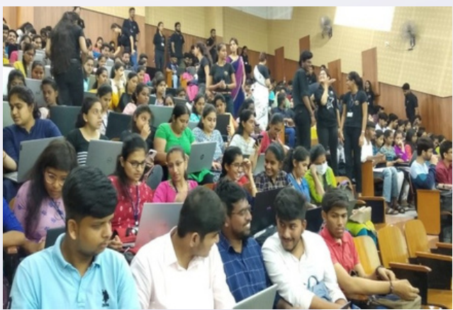
Students participation in the Workshop