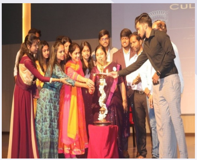
Inauguration of FRISSION-2022