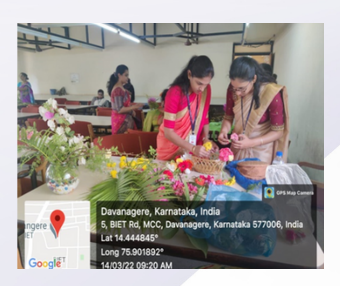
Faculties participating during the Competition