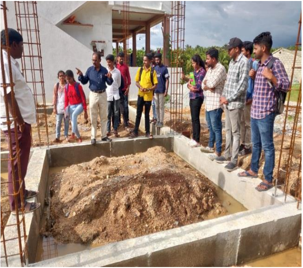
Visits to various Construction sites during Internship.