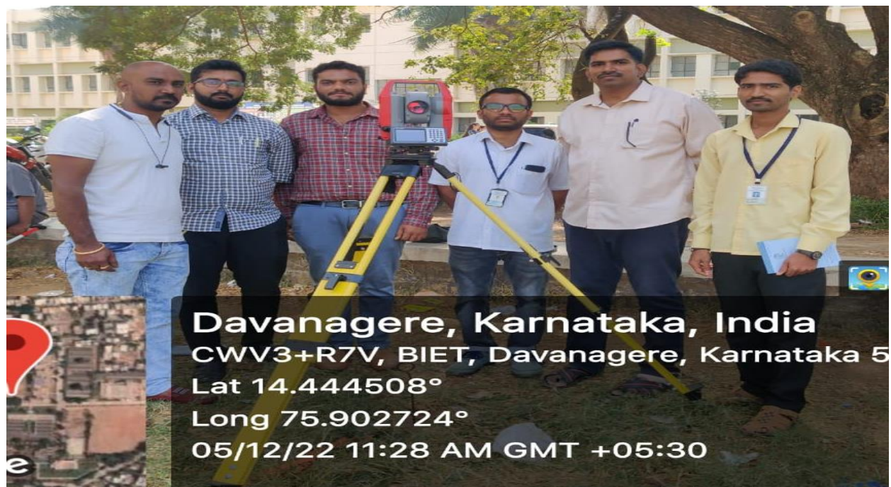
Five days hands on training on "Advanced Total Station, Drone and Autoplotter" organized on 5<sup>th</sup> to 9<sup>th</sup> December 2022.

Newsletter of Civil Engineering Department: July 2022- December 2022