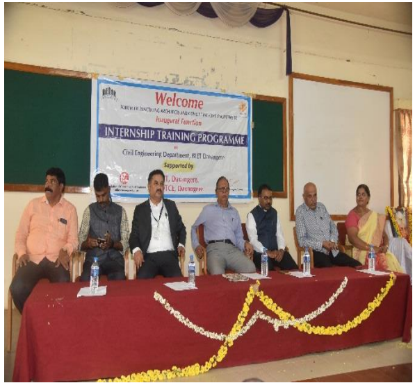
Inauguration of Internship for final year BE students (2019-23 batch) on 5<sup>th</sup> September 2022.