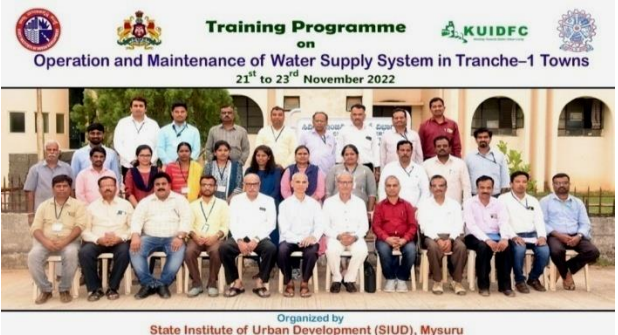
State Institute of Urban Development (SIUD), Mysuru In association with Bapuji Institute of Engineering and Technology, Davanagere Spensored by Karnataka Urban Infrastructure Development and Finance Corporation (KUIDFC), Bengaluru

• From 21<sup>st</sup> to 23<sup>rd</sup> of November 2022, in association with State Institute of Urban Development (SIUD), Mysuru, Department successfully organized 3 days of training programme on "Operation and Maintenance of Water Supply System in Tranche-1 Towns" to PWD Engineers.