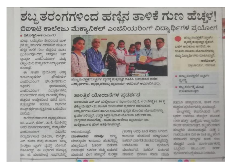
AnveshanA Regional award 20-21