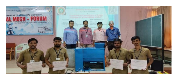
Project got Selected for Top 10 Indian Innovation Express