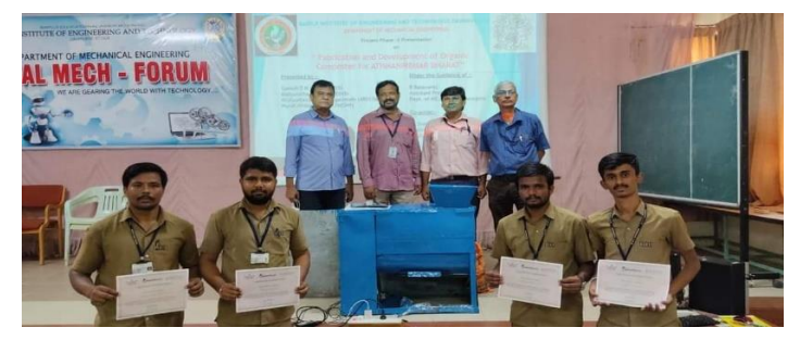
Project got Selected for Top 10 Indian Innovation Express