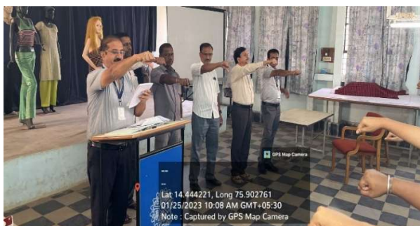
Oath taking by voters