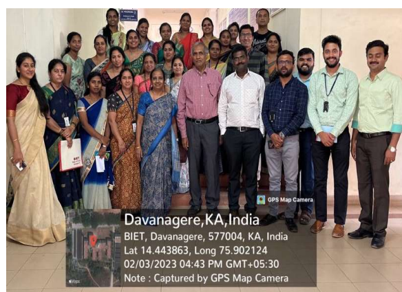
FDP by IS&E