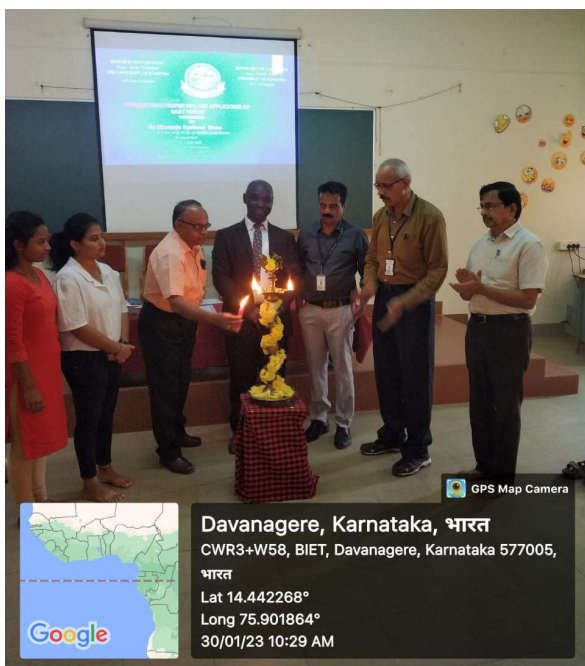
Inauguration of workshop