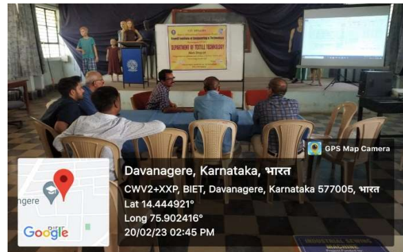
Meeting -Scheme & syllabus -2022

NEP 2022 on 20-2-23 at the department of Textile Technology, BIET.