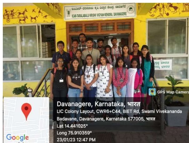
Students at TKVK